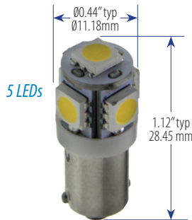
Ba9s Single-Contact Bayonet Base

Replaces Incandescent Bulbs 24MB, 24RB, 1437, 1818 and W568