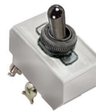
TS-2 LED LUMINAIRE ON/OFF SAFETY SWITCH